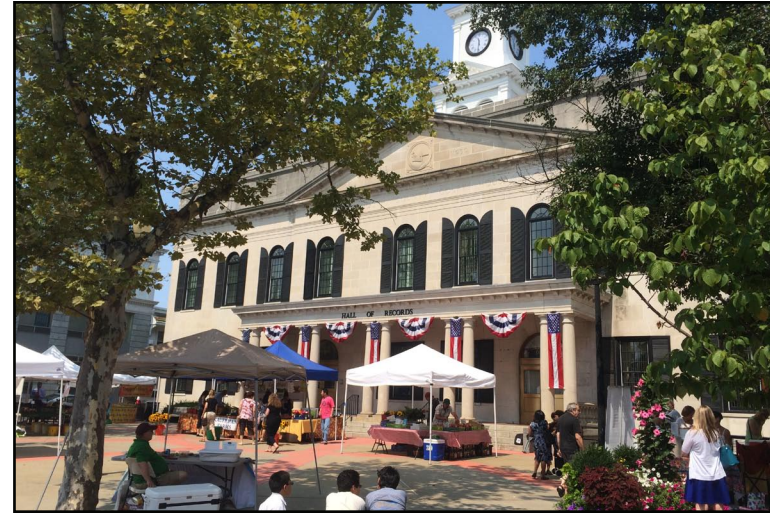
Hall of Records in Freehold Borough

Monmouth County is the most northern county along the Jersey Shore and is part of the New York Metropolitan region. With a population of 630,380 (2010), it's the fifth most populous county in the State of New Jersey and is ranked 38th among highest-income counties in the United States. Monmouth County's 472 square miles of land is home to 53 municipalities, ranging in size from 0.1 square miles to 62.1 square miles, with populations ranging from 380 to 68,000 individuals, the majority of whom live within 5 miles of the 27-mile coastline. The County Seat is Freehold Borough, located in central Monmouth County near State Routes 9 and 33. Monmouth County is accessible by rail, through the North Jersey Coast Line, and bus routes within the County and to New York City.