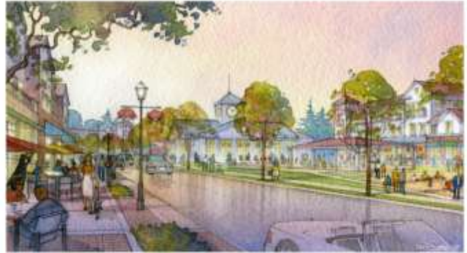
Tinton Falls Town Center

Also, during this period the economic revitalization study supporting the plan was thoroughly examined. The planning team's economic members met with Authority staff and New Jersey state officials throughout the period. Discussions focused on prospective businesses and business stimulation, job creation and economic drivers of the plan.