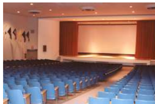
The theater building, with its auditorium and additional space, may be suitable for a theater or arts group