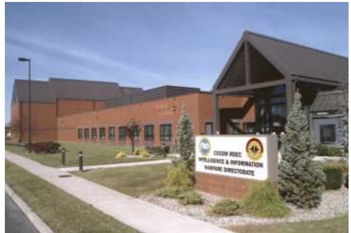
McAfee Center is proposed to be adaptively reused

Squier Hall, currently used for administrative purposes, is readily adaptable for use as an educational facility. To the south of the technology cluster, Armstrong Hall presents another opportunity for educational reuse or an environmental center. Programs to educate visitors as well as the undertaking of environmental/ecological research experiments in the adjacent tidal and terrestrial areas are envisioned.