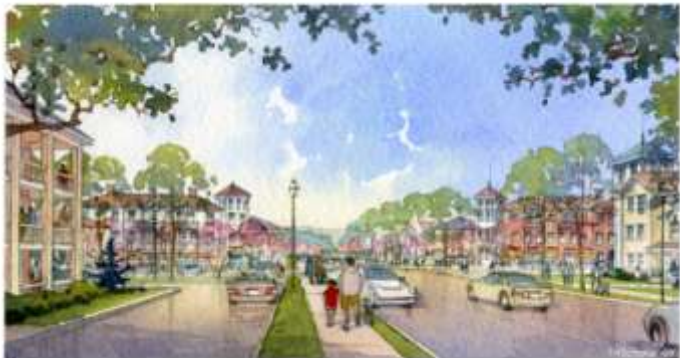
Oceanport Town Center