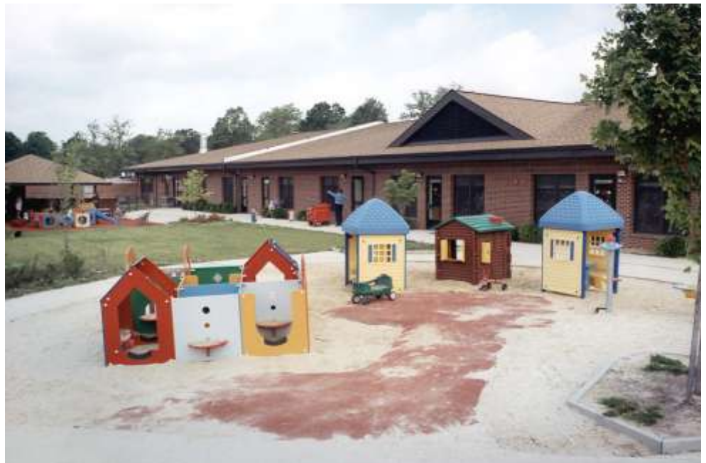
The Early Child Development Center is proposed for reuse

The existing civic uses along Hope Road are proposed to remain and include the Early Child Development Center, Pool and Park Complex, and the Teen Center converted to a community recreation center. All development areas within the Tinton Falls area are proposed to be connected to a continuous greenbelt. The greenbelt is part of the Fort-wide “Blue-Green” belt system of parks and open space. It would serve as a passive and active recreational amenity while preserving and protecting the wetland resources in this area of the Fort. Approximately 22 acres of active recreation, 77 acres of passive recreation and 3.25 miles of trails are proposed in Tinton Falls.