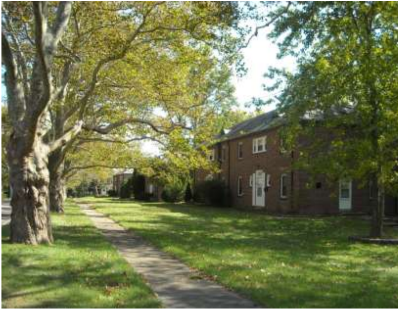
Tinton Falls Neighborhood homes include reuse of the Hemphill residences

house a financial/insurance company data recovery center, general office space, and technological communications research and development companies. The Myer Center is proposed to be modified as three separate facilities to enhance its adaptive reuse and increase its operational efficiency. The business center provides a mix of Class A general office space, high tech research and development space, and incubator space in new and renovated buildings. This reuse area is expected to serve as one of the primary economic engines, generating tax revenue and employment opportunities.