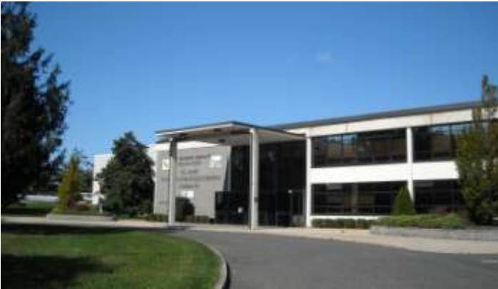
Mallette Hall with its auditorium and outdoor amphitheater has been requested by the Borough of Eatontown

Mallette Hall with its auditorium and outdoor amphitheater has been requested by the Borough of Eatontown to be the new home for the Eatontown Municipal Complex.