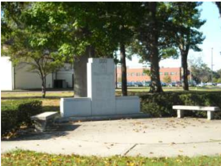
Spanish American War Memorial

The Fort Monmouth Historic District comprises 94 resources that date from the late 1920s through the mid-1930s, with one exception (the WWII Memorial, dating to 1952.) The resources included in the Fort Monmouth Historic District are largely of brick construction and represent a range of uses, including offices and administrative functions, family housing, garages, and a fire station. The