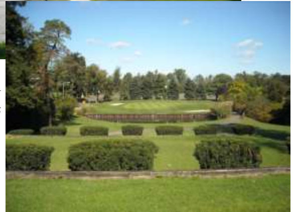
7 th tee at Suneagles

by the Fort's redevelopment. The units would include apartment-style housing along a linear green space. Convenience retail will also be provided to the west. Collaboration with Habitat for Humanity is planned.