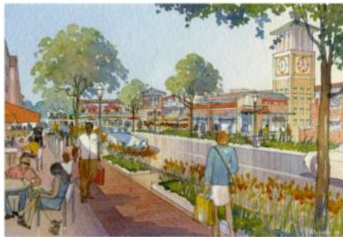
Eatontown Town Center