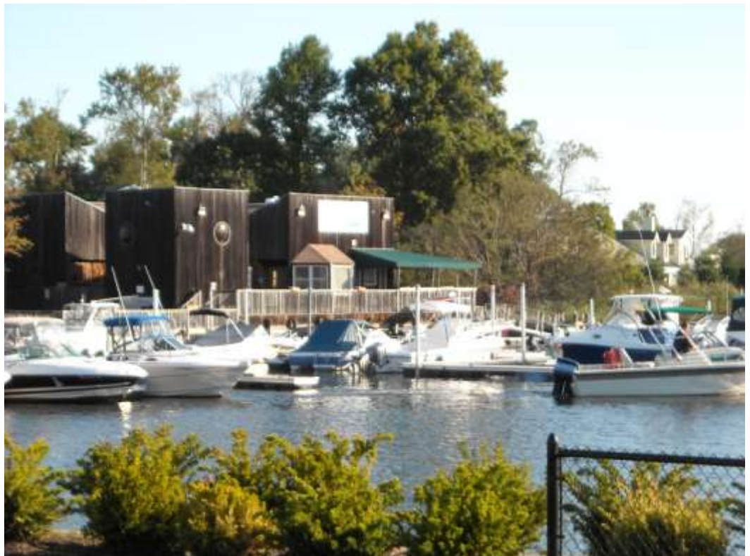
A public promenade and gateway pocket park just east of the bridge over Oceanport Creek are proposed improvements to the marina

The educational component includes a site for future school development to meet Oceanport's growth needs. The site is sized to accommodate academic space, parking, ball fields, tennis courts, and flexible outdoor recreational space. A linear greenway connects the Education/Medical