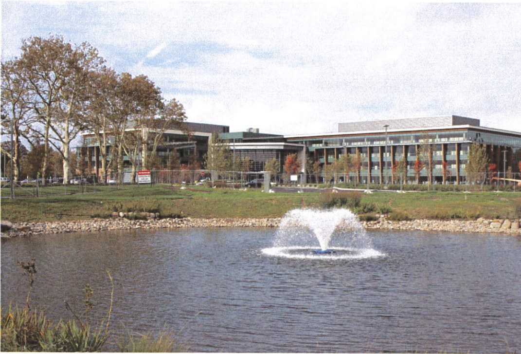
CommVault's new Headquarters located across Corregidor Road from Building 2560

FMERA acquired the former Patterson Hospital in Oceanport from the Army and sold it to AcuteCare Health System in March 2014. AcuteCare is renovating the 100,000 sf building for use as an outpatient health clinic. The facility is scheduled to open in the 1 st Quarter of 2015.