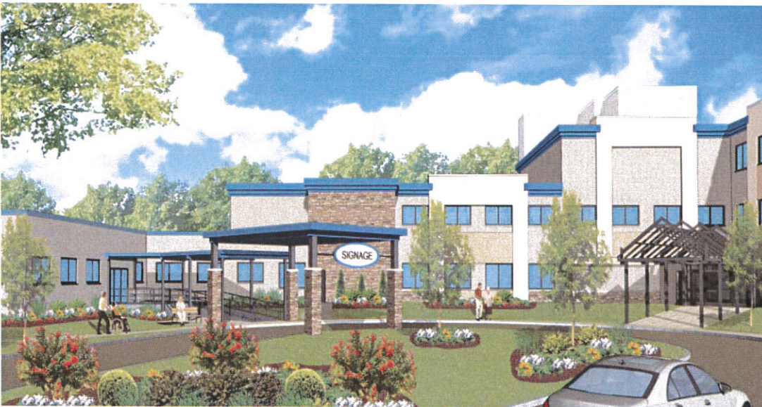
Rendering of AcuteCare's renovated facility

FMERA acquired the former Patterson Hospital in Oceanport from the Army and sold it to AcuteCare Health System in March 2014. AcuteCare is renovating the 100,000 sf building for use as an outpatient health clinic. The facility is scheduled to open in the 1 st Quarter of 2015.