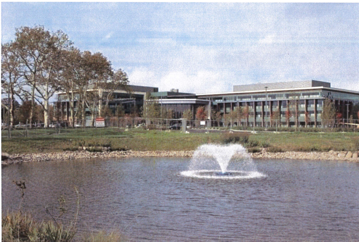
CommVault’s new headquarters located in the Tinton Falls Reuse Area

Fort Monmouth consists of 1,127 acres located in the Boroughs of Tinton Falls, Eatontown and Oceanport, New Jersey. Established in 1917 as Camp Little Silver, the Fort served as the home of the Signal Corps, and later CECOM, the Army’s Communications and Electronics Command. The Fort was designated for closure in the 2005 BRAC round, and formally closed in September 2011. FMERA entered into the EDC Agreement with the Army in June 2012, and took title to an initial property, a 55-acre tract in Tinton Falls known as Parcel E, in January 2013. FMERA subsequently sold Parcel E to CommVault, one of the nation’s leading data and information management software companies, for construction of a new headquarters complex. CommVault completed and occupied the first building in the complex, a 275,000 sf facility for 900 employees, in late 2014. The company has approvals in hand to develop up to 650,000 sf for an estimated 2,500 employees.