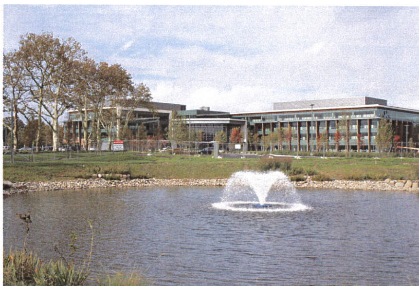
CommVault’s new Headquarters located across Corregidor Road from Parcel F-1

Fort Monmouth consists of 1,127 acres located in the Boroughs of Tinton Falls, Eatontown and Oceanport, New Jersey. Established in 1917 as Camp Little Silver, the Fort served as the home of the Signal Corps, and later CECOM, the Communications and Electronics Command. The Fort was designated for closure in the 2005 BRAC round, and formally closed in September 2011. FMERA entered into the EDC Agreement with the Army in June 2012, and took title to an initial property, a 55-acre tract in Tinton Falls known as Parcel E, in January 2013. FMERA subsequently sold Parcel E to CommVault, one of the nation’s leading data and information management software companies, for construction of a new headquarters complex for the company. CommVault is planning to occupy the first building in the complex, a 275,000 sf facility for 900 employees, by the end of 2014. The company has approvals in hand to develop up to 650,000 sf for an estimated 2,500 employees.