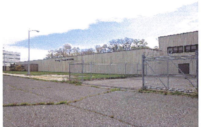
Night Vision Lab (Building 2705)

The Army issued an environmental clearance document, known as a Finding of Suitability to Transfer (“FOST”), covering all but 0.285 acres of the Property in August 2013. The FOST can be found at: