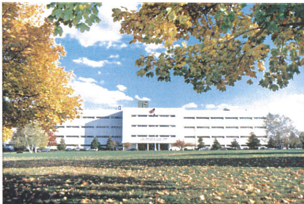
Myer Center (Building 2700)

The Property provides potential purchasers high visibility from the Garden State Parkway, one of the most traveled highways in the state. In addition the Property offers excellent access to public transportation, the local road network and area amenities. The Property consists of 38 acres of land and the 673,450 sf Myer Center (Building 2700), the 47,592 sf Night Vision Lab (Building 2705), and their support buildings totaling 12,644 sf (Buildings 2701, 2706, 2715 and 2718). FMERA acquired title to the Property by deed from the Army in June 2014.