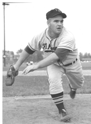
Members of the Fort Monmouth Army Baseball team