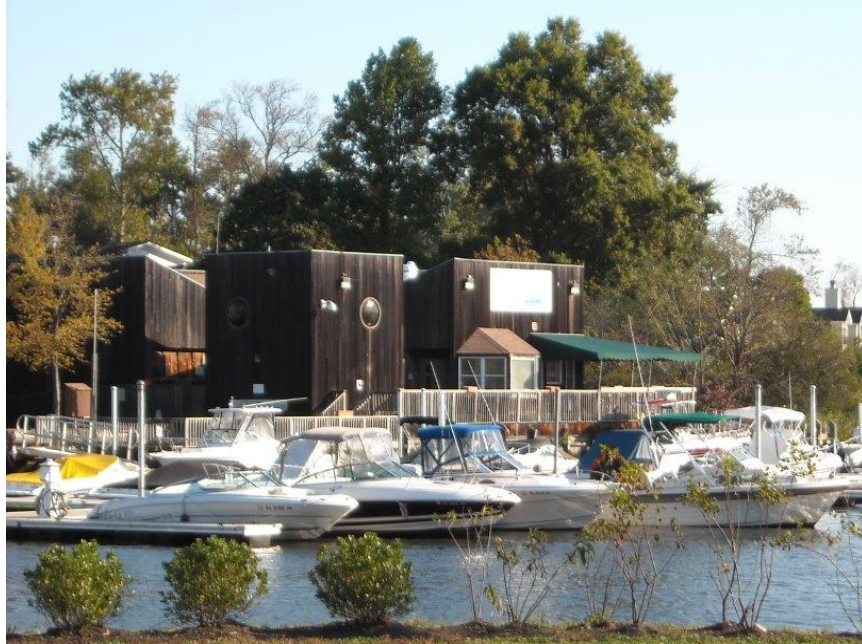
The marina in Oceanport in operation in May 2009, before the Fort's closure in 2011.