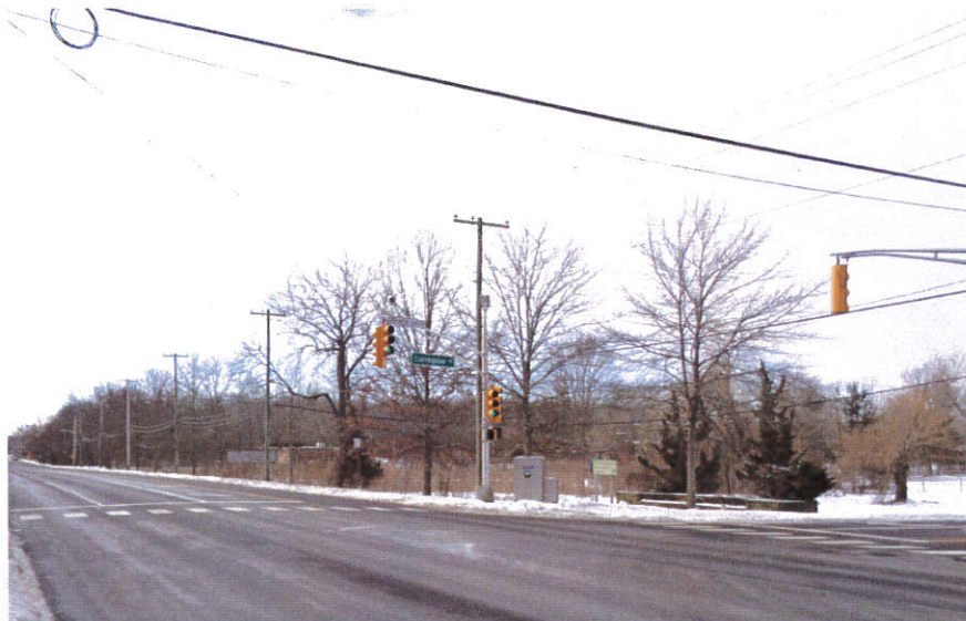
View of the Property looking south on Hope Road