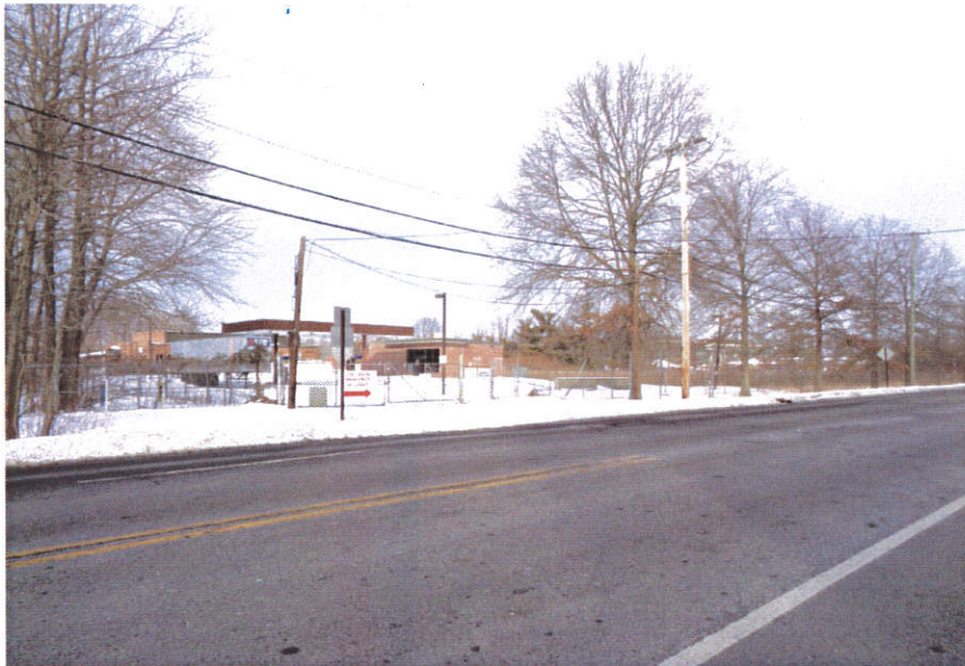
View of the Property looking north on Hope Road

to approval of the application for development. Approval of a Reuse Plan amendment or a “use-type” variance would be at the sole discretion of the FMERA Board.