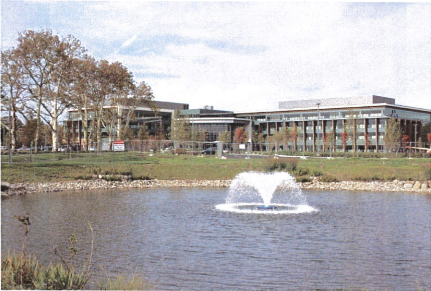
CommVault’s new headquarters located across Corregidor Road from Parcel F-3

Fort Monmouth consists of 1,127 acres located in the Boroughs of Tinton Falls, Eatontown and Oceanport, New Jersey. Established in 1917 as Camp Little Silver, the Fort served as the home of the Signal Corps, and later CECOM, the Communications and Electronics Command. The Fort was designated for closure in the 2005 BRAC round, and formally closed in September 2011. FMERA entered into the EDC Agreement with the Army in June 2012, and took title to an initial property, a 55-acre tract in Tinton Falls known as Parcel E, in January 2013. FMERA subsequently sold Parcel E to CommVault, one of the nation’s leading data and information management software companies, for construction of a new headquarters complex for the company. CommVault occupied the first building in the complex, a 275,000 sf facility for 900 employees, in late 2014. The company has approvals in hand to develop up to 650,000 sf for an estimated 2,500 employees.