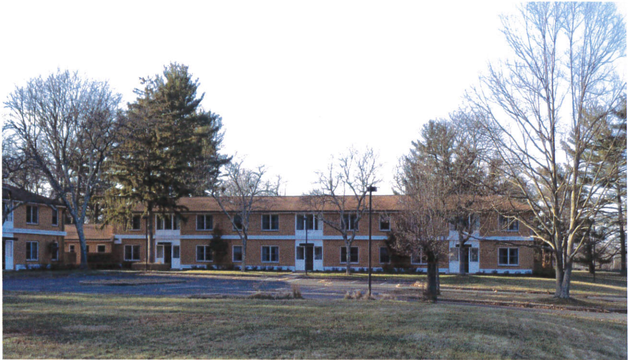
View of the Nurses Quarters from Main Street, Oceanport

The Property consists of approximately 3.75 acres of land including Buildings 1077 & 1078, totaling 18,655 gsf. Known as the former Nurses Quarters, the buildings contain 24 one- and two bedroom apartments along with laundry and storage facilities, lawn areas, and off-street parking. The buildings are heated and cooled by a geothermal system. Stephenson Avenue (a/k/a Cockayne Avenue) is currently closed to vehicular and pedestrian traffic. The successful Potential Purchaser will be responsible for reopening Stephenson Avenue at its intersection with Main Street and making any required improvements to Stephenson Avenue where it abuts the Property. FMERA anticipates that, at a minimum, those improvements will entail resurfacing the roadway. Potential Purchasers should consider the cost of the Stephenson Avenue improvements when formulating their Offers for the Property. FMERA will work with the successful Potential Purchaser and the owner of the former Patterson Army Hospital, AcuteCare Management Systems, to dedicate Stephenson Avenue as a public right of way.