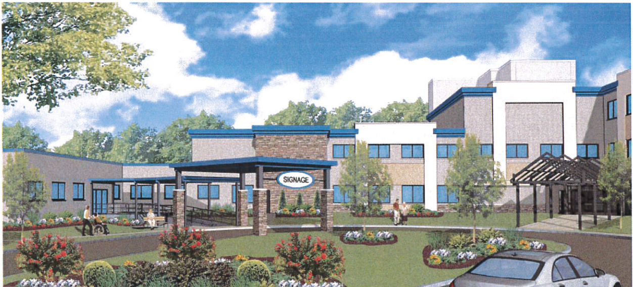
Rendering of AcuteCare's renovated facility, the former Patterson Army Hospital, which is located adjacent to the Property in the Oceanport Reuse Area

FMERA acquired the former Patterson Hospital from the Army and sold it to AcuteCare Health System in March 2014. AcuteCare is renovating the 100,000 sf building for use as an outpatient health clinic. The facility's first phase is scheduled to open in the 1 st Quarter of 2015.