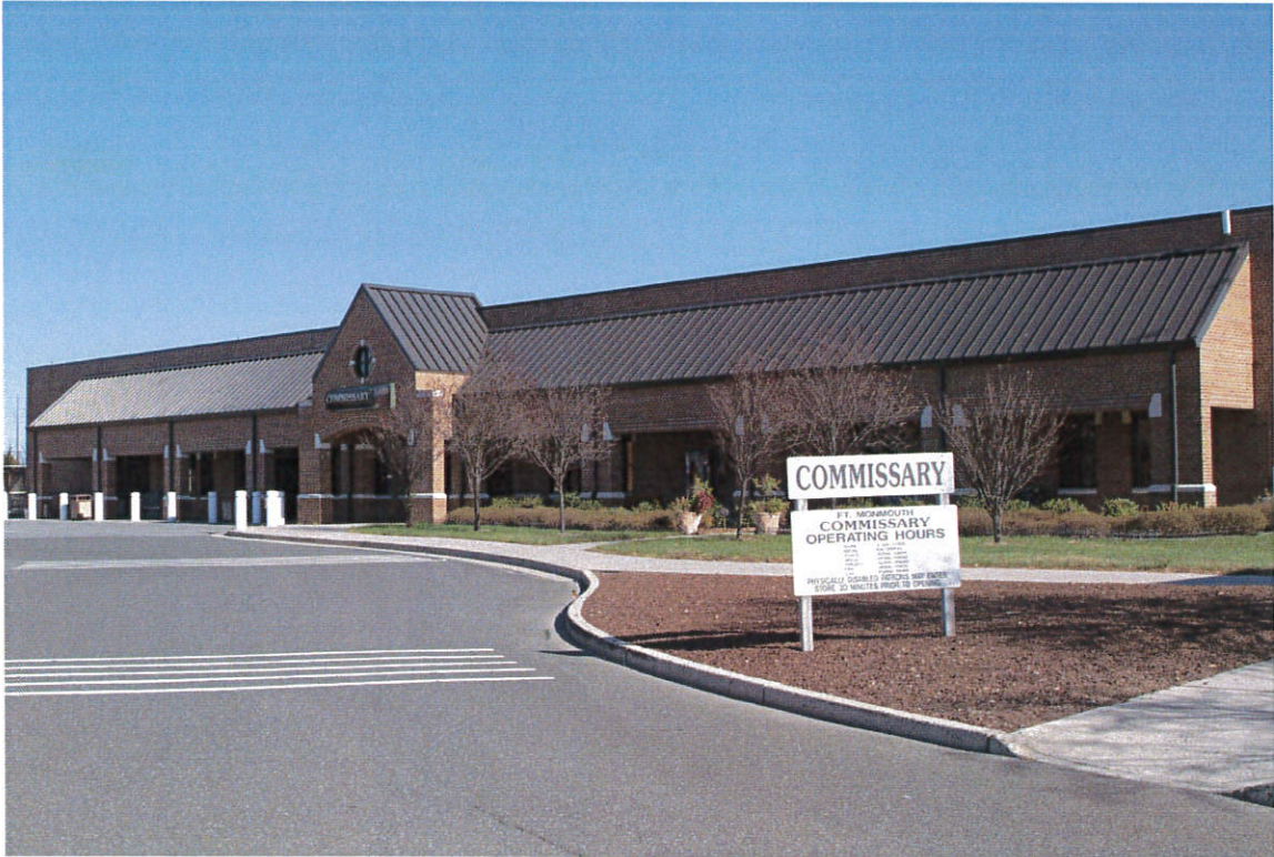
Building 1007, the former Fort Monmouth Commissary