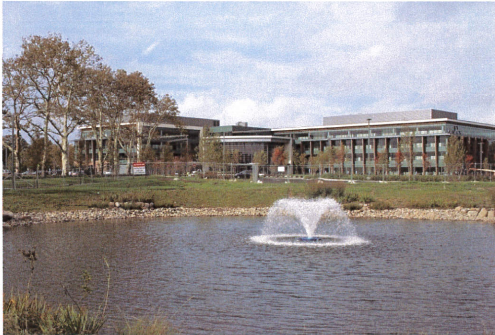
CommVault's new headquarters located in the Tinton Falls Reuse Area

subsequently sold Parcel E to CommVault, one of the nation's leading data and information management software companies, for construction of a new headquarters complex for the company. CommVault occupied the first building in the complex, a 275,000 sf facility for 900 employees, in late 2014. The company has approvals in hand to develop up to 650,000 sf for an estimated 2,500 employees.