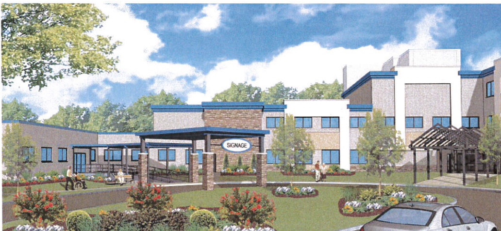
Rendering of AcuteCare's renovated facility, which is located near the Property in the Oceanport Reuse Area

FMERA acquired the former Patterson Hospital from the Army and sold it to AcuteCare Health System in March 2014. AcuteCare is renovating the 100,000 sf building for use as an outpatient health clinic. The facility opened in the 1 st Quarter of 2015.