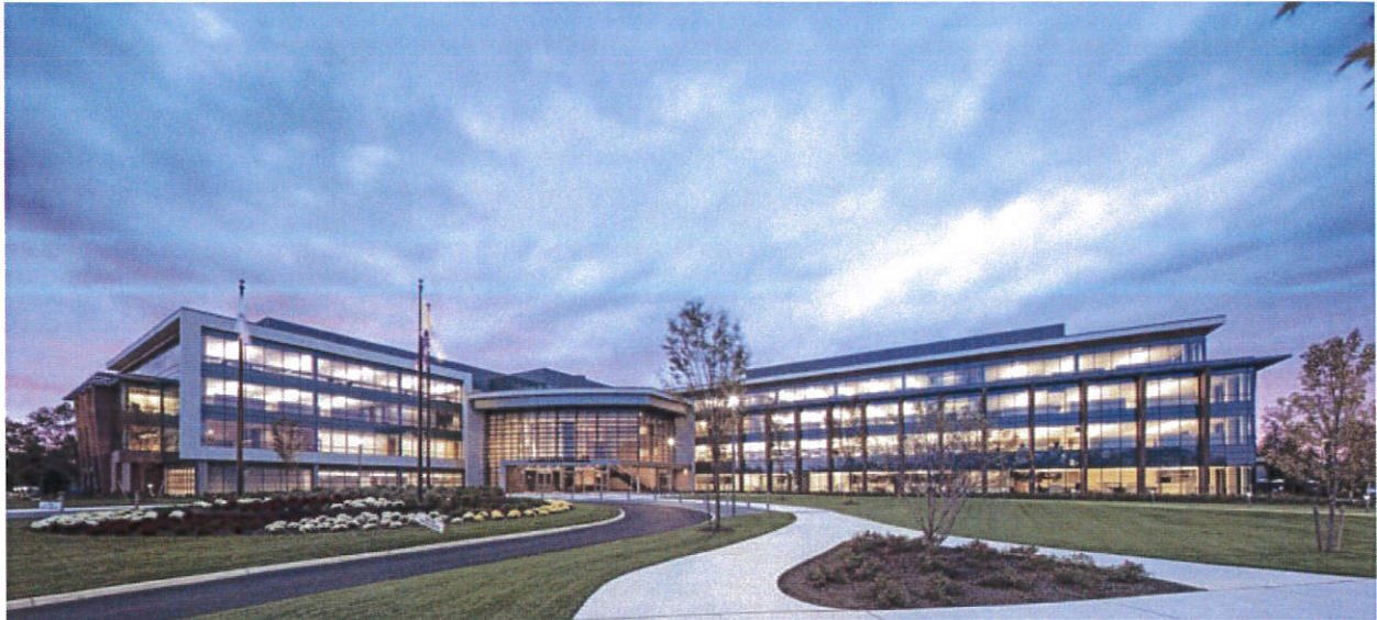
Commvault's new Headquarters

FMERA acquired the former Patterson Hospital from the Army and sold it to AcuteCare Health System in March 2014. AcuteCare renovated the 100,000 sf building for use as an outpatient health clinic. The facility opened in the 1st Quarter of 2015.