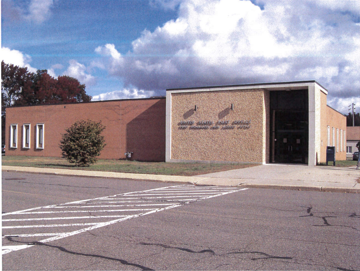
Building 1005, the former Fort Monmouth Post Office

The Property consists of an approximately six (6) acre parcel of land containing four (4) buildings: the 7,641± sf former Post Office (Building 1005), constructed in 1971; Tickets & Tours (Building 1010), a 2,600± sf building constructed in 1970; Building 800, a circa 1942 14,964± sf administration and classroom building renovated by the Army; and Building 801, the 9,267± sf recreation equipment checkout facility built in 1941 (together, the “Property”). The Property borders on Todd, Alexander and Rasor (aka Anson) Avenues in the Oceanport Reuse Area of the Fort.