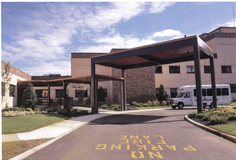
AcuteCare's renovated facility in Oceanport

FMERA acquired the former Patterson Hospital from the Army and sold it to AcuteCare Health System in March 2014. AcuteCare renovated the 100,000 sf building for use as an outpatient health clinic. The facility opened in the 1st Quarter of 2015.