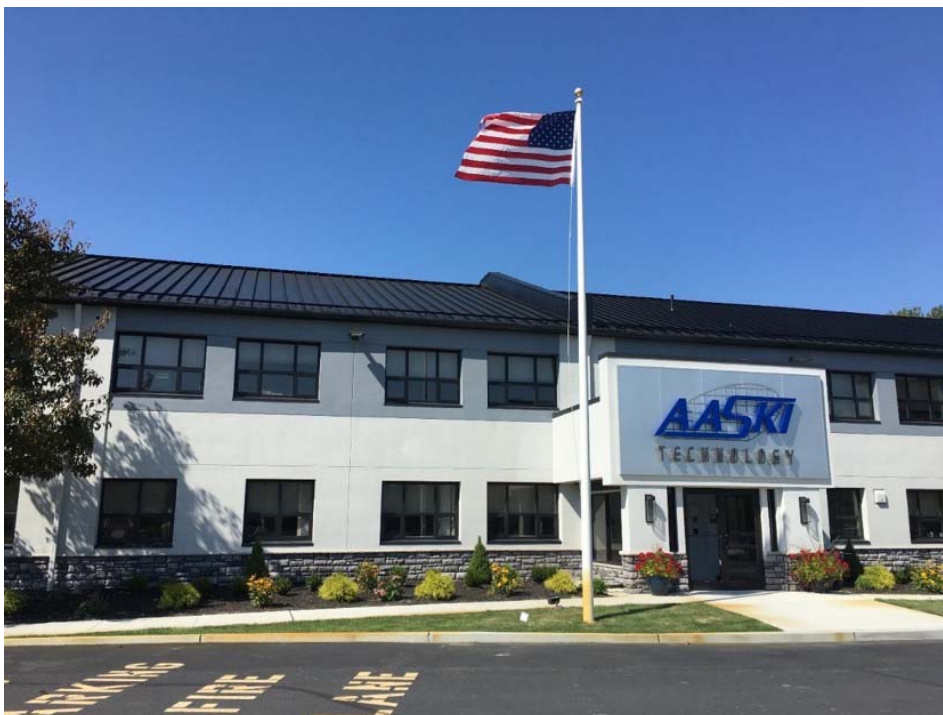
Building 2525 in Tinton Falls, home of Aaski Technology

FMERA acquired Building 2525 in Tinton Falls from the Army and sold it to RADAR Properties in February 2016. RADAR is leasing approximately 30,000 square feet of the building to Aaski Technology, Inc., a defense contractor and communications engineering firm, and sold the remaining portion of the building to J. F. Kiely, a family of companies offering extensive construction and engineering services.