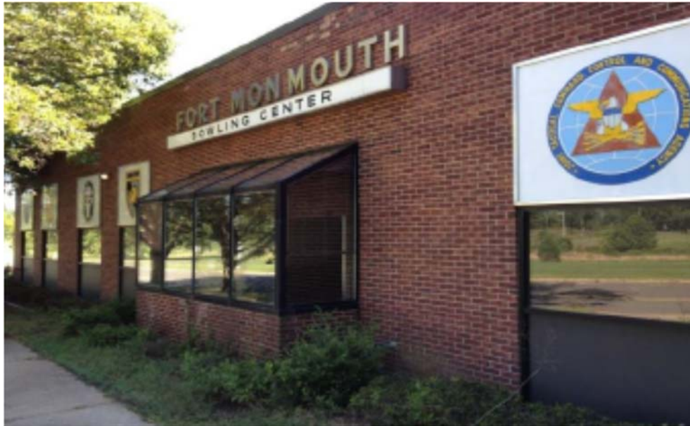
Building 689 – Bowling Center

The Property consists of 2.825± acres of land, Building 689, the Bowling Center (approximately 17,599 sf), and Building 682 (approximately 4,720 sf), located in the Eatontown section of the Fort's Main Post. Building 682 must be demolished by the selected Purchaser.