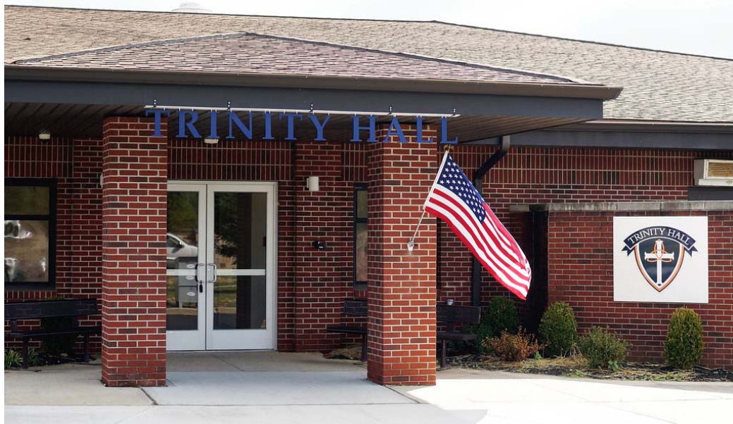
Building 2290 in Tinton Falls, Trinity Hall

FMERA acquired the former Building 2290 in Tinton Falls from the Army as part of the Phase I EDC and sold it to Trinity Hall Corporation in March 2016. Trinity Hall renovated the 19,600 sf former child development center building for use as a private high school for girls. The facility opened in September 2016 for the 2016-2017 school year. The school received approvals in January 2018 for its Phase 2 expansion, a two-story edition, which will include new classrooms, office and administrative space, a multipurpose room, a chapel, and a new entrance lobby.