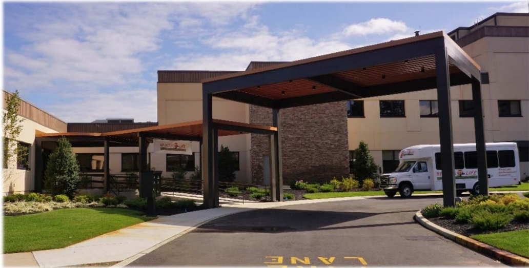
AcuteCare's renovated facility in the Oceanport Reuse Area