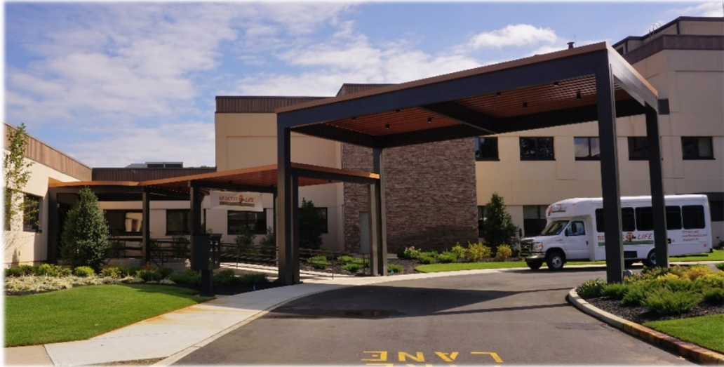
AcuteCare's renovated facility in the Oceanport Reuse Area

FMERA acquired Building 2525 in Tinton Falls from the Army and sold it to RADAR Properties in February 2016. RADAR is leasing approximately 30,000 square feet of the building to Aaski Technology, Inc., a defense contractor and communications engineering firm, and sold the remaining portion of the building to J. F. Kiely, a family of companies offering extensive construction and engineering services.