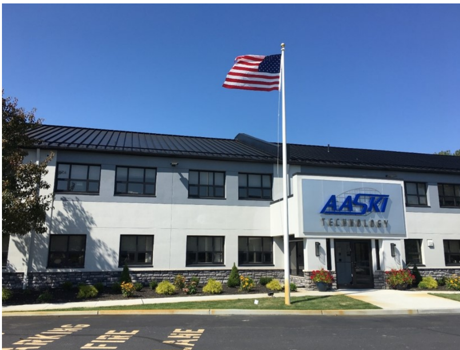
Building 2525 in Tinton Falls, home of Aaski Technology

FMERA acquired Building 2525 in Tinton Falls from the Army and sold it to RADAR Properties in February 2016. RADAR is leasing approximately 30,000 square feet of the building to Aaski Technology, Inc., a defense contractor and communications engineering firm, and sold the remaining portion of the building to J. F. Kiely, a family of companies offering extensive construction and engineering services.