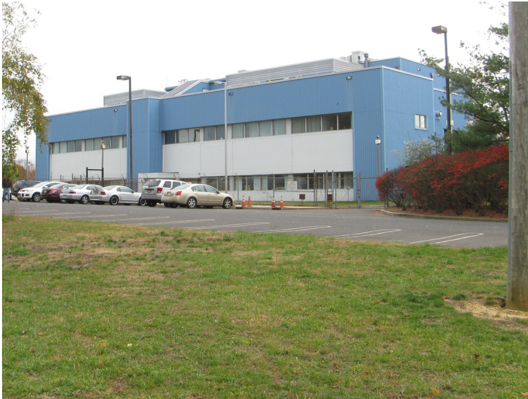
Building 2707, Pulse Power