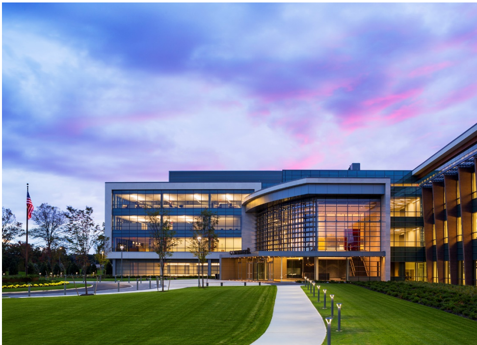
CommVault's new headquarters located in the Tinton Falls Reuse Area

Fort Monmouth consists of 1,127 acres located in the Boroughs of Tinton Falls, Eatontown and Oceanport, New Jersey. Established in 1917 as Camp Little Silver, the Fort served as the home of the Signal Corps, and later CECOM, the Communications and Electronics Command. The Fort was designated for closure in the 2005 BRAC round, and formally closed in September 2011. FMERA entered into the EDC Agreement with the Army in June 2012, and took title to an initial property, a 55-acre tract in Tinton Falls known as Parcel E, in January 2013. FMERA subsequently sold Parcel E to Commvault, one of the nation's leading data and information management software companies, for construction of a new headquarters complex for the company. Commvault occupied the first building in the complex, a 275,000-sf facility for 900 employees, in late 2014. The company has approvals in hand to develop up to 650,000 sf for an estimated 2,500 employees.