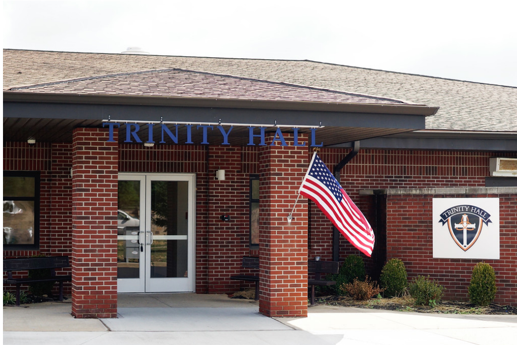
Building 2290 in Tinton Falls, Trinity Hall

former child development center building for use as a private high school for girls. The facility opened in September 2016 for the 2016-2017 school year. The school received approvals in January 2018 for its Phase 2 expansion, a two-story edition, which will include new classrooms, office and administrative space, a multipurpose room, a chapel, and a new entrance lobby.