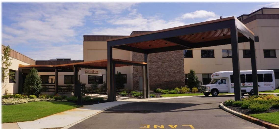
AcuteCare's renovated facility in the Oceanport Reuse Area

FMERA acquired the former Patterson Hospital from the Army and sold it to AcuteCare Health System in March 2014. AcuteCare renovated the 100,000 sf building for use as an outpatient health clinic. The facility opened in the 1 st Quarter of 2015 and has recently added 81 senior-living units to the property.