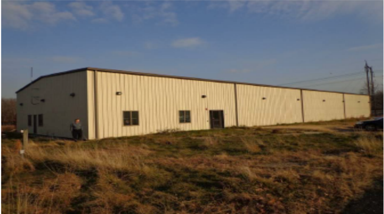
Building 2627 - Pistol Range

Per the Reuse Plan, the Pistol Range (Building 2627) is envisioned for reuse as a gun range and Building 2629 is envisioned for reuse as a fire training center by state, county or local governmental entities. Based on amendments to the Reuse Plan and the planned, adjacent development, these uses may no longer be the highest and best use of the Property and therefore, FMERA will accept Offers for alternate uses consistent with and complementary to the surrounding development. However, as described above in Section 1.0, an Offer to demolish Building 2627 or reuse and redevelop the parcel for anything other than a shooting range will require an amendment to the Reuse Plan.