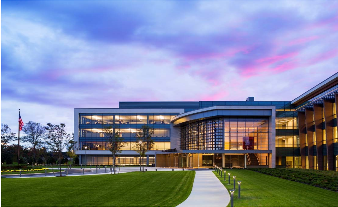
CommVault's new headquarters located in the Tinton Falls Reuse Area

late 2014. The company has approvals in hand to develop up to 650,000 sf for an estimated 2,500 employees.