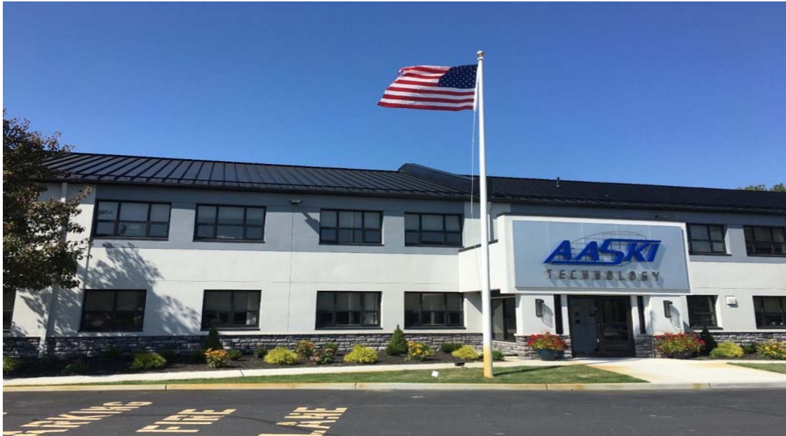
Building 2525 in Tinton Falls, home of Aaski Technology

FMERA acquired Building 2525 in Tinton Falls from the Army and sold it to RADAR Properties in February 2016. RADAR is leasing approximately 30,000 square feet of the building to Aaski Technology, Inc., a defense contractor and communications engineering firm, and sold the remaining portion of the building to J. F. Kiely, a family of companies offering extensive construction and engineering services.