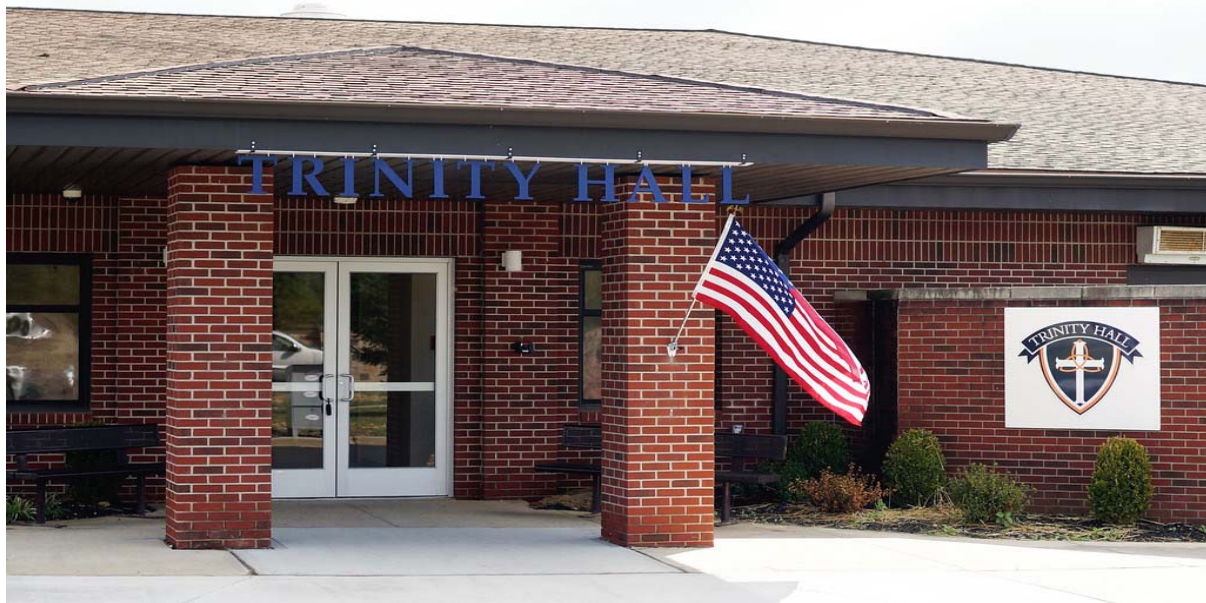
Building 2290 in Tinton Falls, Trinity Hall

Last year, the New Jersey Economic Development Authority and FMERA executed an agreement with Robert Wood Johnson/Barnabas Health for the development of a new health care campus of up to 2 million square feet in the Tinton Falls section of the Fort. Located immediately north of the Pulse Power Building on Pearl Harbor Avenue, this proposed project is planned to break ground in early 2020.